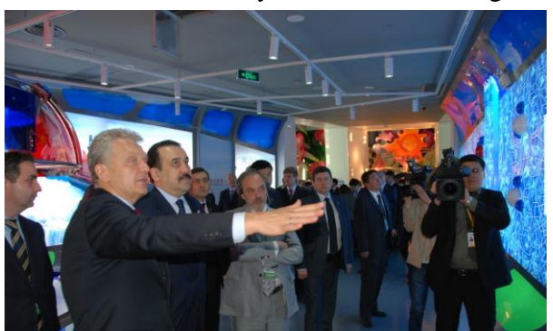
Kazakhstan Prime Minister and Russia's Minister of Industry and Trade in the Pavilion

"Russia is the strategic partner of Kazakhstan. Wishing best of luck to your Pavilion!" - Prime Minister of Kazakhstan Karim Massimov wrote in the guest book